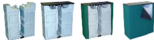
CASE-TO-COUNTER CONVERSION KIT