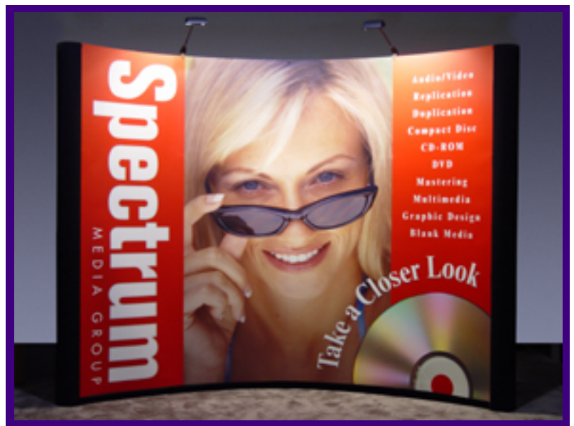
10 FOOT ARC BOOTH WITH FRONT MURAL PANELS